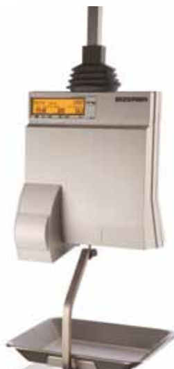
BC II 400 Suspended scales

Multi-use BC II scales offer all the functions and features you expect these days as well as fast and easy operation. Eye contact with customer always guaranteed.