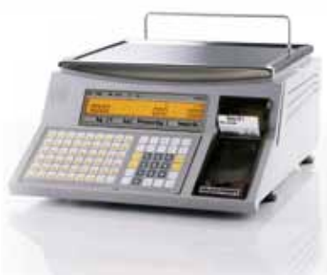
BC II 100 E Electronic top-pan scales with label printer