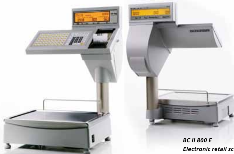
BC II 800 E Electronic retail scales with display, keyboard and printer on a mounted stand