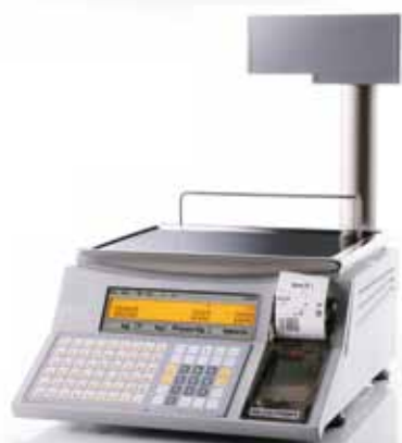
BC II 200 F-E Electronic top-pan scales with customer display on a mounted stand